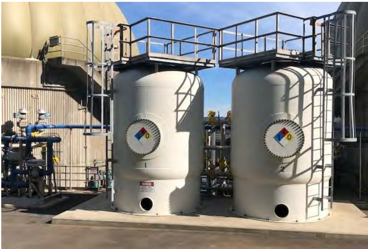
Figure 5. CMSA anaerobic digesters, and hydrogen sulfide media filters that remove hydrogen sulfide from the biogas before it is sent to the cogeneration engine.

Kennedy/Jenks Consultants. 2011. 2009 F2E Work Plan Food-Waste to Energy Facility Predesign . San Rafael, CA: Central Marin Sanitation Agency.