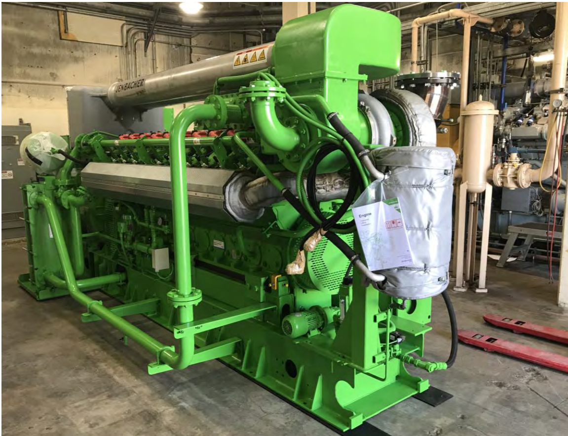
Figure 4. New Jenbacher Cogeneration Engine awaiting installation, with existing engine in background.

funded the planning and pre-design of the new cogeneration system. Design and construction will require a $6 million investment, which will be funded by capital reserves.