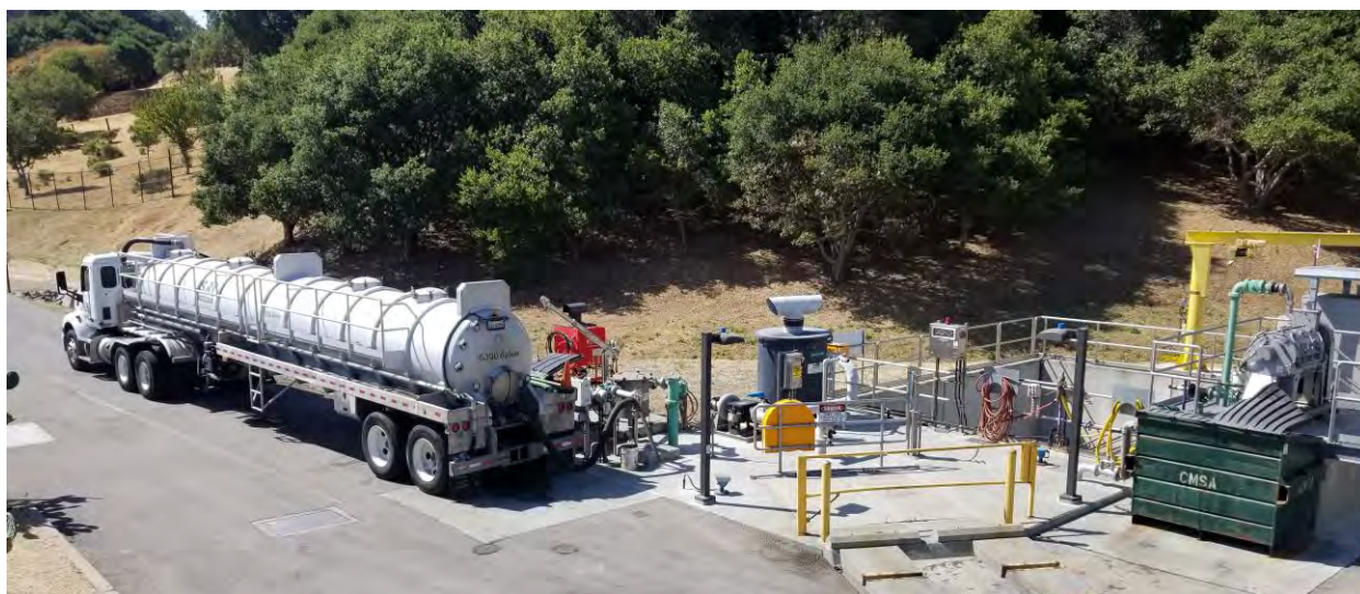
Figure 3. Truck offloading FOG at CMSA Organic Waste Receiving Facility.

CMSA incurred $2 million in costs for the organic waste receiving station, which includes a 30,000-gallon tank, mixing pumps, rock trap grinder, paddle finisher, and odor control system. This investment was bundled within a $7.65 million investment package of digester upgrades, including new flexible membrane covers, pump mixing systems, and hydrogen sulfide scrubbers. CMSA covered the investment costs for the whole package from its capital investment accounts, including funds left over from a prior bond issue for a wet water management project, and the investment returns from those funds.