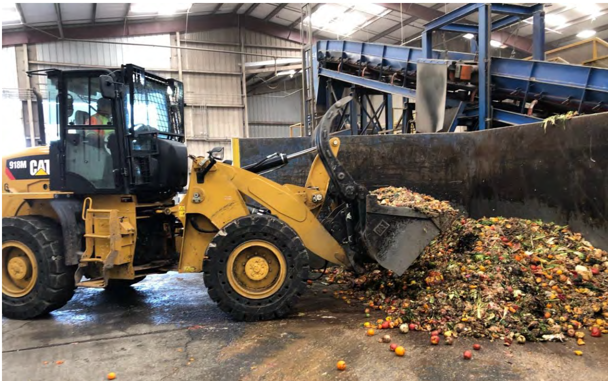
Figure 2. After an initial screening for contaminants on the MSS tipping floor, food scraps are loaded onto a conveyor belt for additional removal of contaminants.

A dedicated MSS outreach coordinator works closely with generators, starting with an assessment as to which organics option is right for each generator. The coordinator organizes the official enrollment in the F2E program, provides staff training and monitoring, and provides re-training over time as needed. Another element promoting the quality of generators' participation is a dedicated rear-loader garbage truck. Though the rear-loaders are more expensive, MSS chose this model so that the driver can inspect loads as he empties the bins into the truck hopper; the driver notes any contaminants and communicates this back to the outreach coordinator, who follows up with the responsible generator. MSS has dropped a few participants due to repeated quality problems, but its focus is on retraining any customers with repeated contamination episodes, so that all provide clean materials. As a result of this first line in quality control, the MSS material delivered to the transfer station has a low level of contamination.